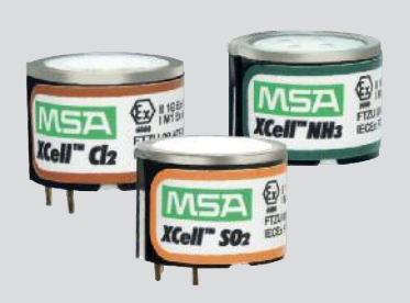
MSA XCELL SENSORS are a breakthrough in chemical and mechanical sensor design, enabling faster response and span calibration times.

The ALTAIR 5X is fully compatible with the MSA GALAXY GX2 Automated Test System and MSA Link™ Pro and MSA Link Software to efficiently manage your entire fleet.